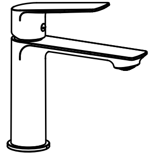
Single-Handle Lavatory Faucet

NOTE: THIS FAUCET IS DESIGNED TO BE INSTALLED THRU 1 HOLE, \Phi 1\text{-}3/8" ( \Phi 35\text{mm} ) MIN.